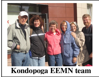
Kondopoga EEMN team

Theme Verse: May the God of hope fill you with all joy and peace as you trust in him, so that you may overflow with hope by the power of the Holy Spirit (Romans 15:13)