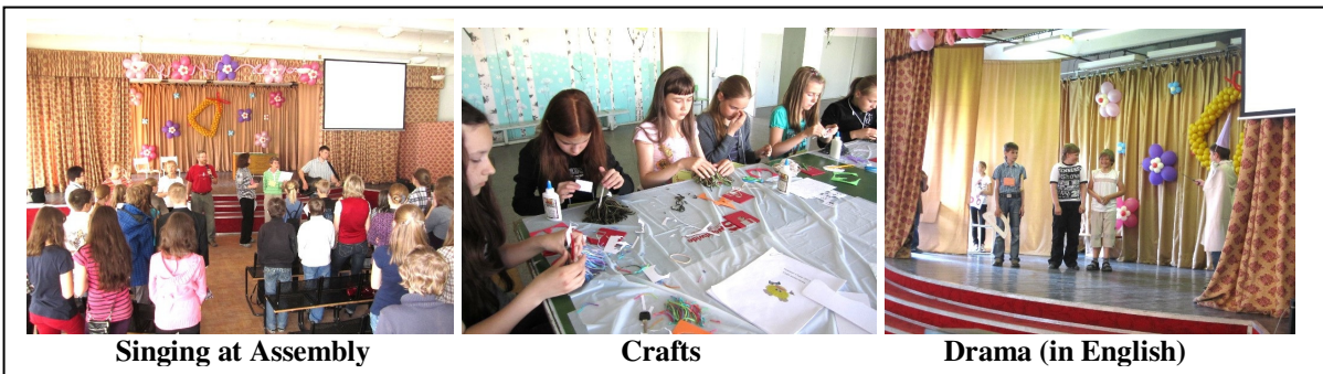
Singing at Assembly

group last year, now 11th graders, wanting to see us and asking on behalf of 7 others in that group if they could get together the following week. noting they recalled the week together the previous year as “one big happy family”—we did, and we all intend to keep in contact via Email as they leave home to follow their destinies. These two anecdotes illustrate important principles of this short-term mission using a curriculum that is biblically based, with singing, crafts, sports, dramas, etc, all in English: 1) giving the kids an opportunity to practice English, 2) sharing the Gospel or simply awakening young people to the possibility of living in relationship to God, and 3) the centrality of relationships. The Principal of School #3 in Kondopoga strongly supports the