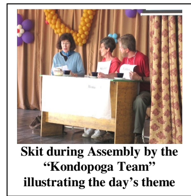
Skit during Assembly by the “Kondopoga Team” illustrating the day’s theme

As we’ve noted, our team was in Kondopoga, 30 miles north of Petrozavodsk, with 50 6th-8th graders week one, 50 9th-10/11th graders week two. Our team of 6 worked well together, and everything went smoothly—no unusual anecdotes to report! At the celebration event Friday afternoon the Russian teacher/ translators shared about the value of the program: Conversational English practice, relationships, spiritual value for their kids. Seeds were planted. More details of these FELCs can be found at our church web site ( www.flcduluth.org/education/global-ministries/russia/ ).